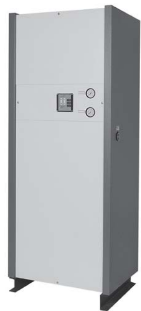
Type 0050 - 1000